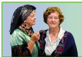
Ladies of Importance

We welcome you to come and join us as a member, or in the audience for a forthcoming show