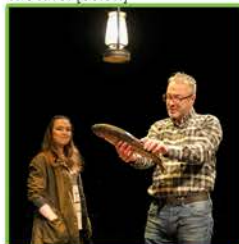
Hound of the Baskervilles [below]