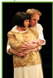
Photographs from last season